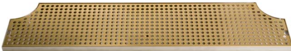
PVD Brass DP-MET-H-SSPVD-34