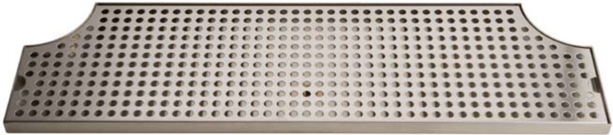
Stainless Steel DP-MET-H-28