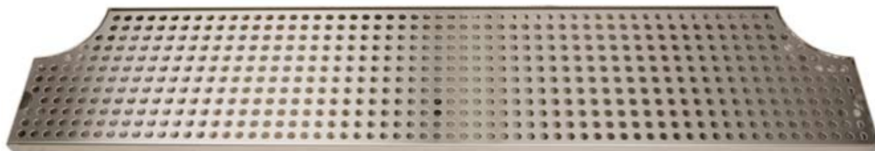
Stainless Steel DP-MET-H-40