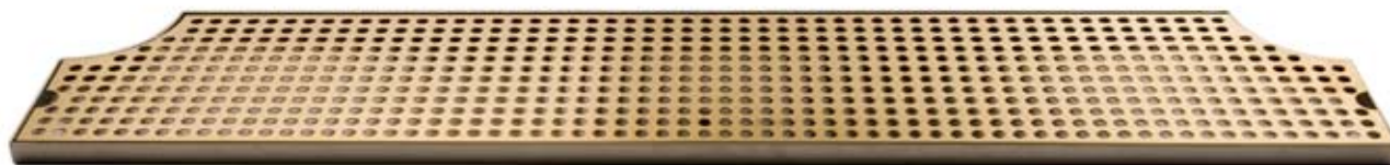
PVD Brass DP-MET-H-SSPVD-40